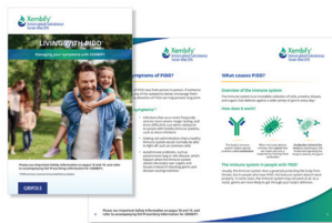
XEMBIFY Patient Brochure