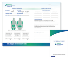
Infusion Log Book